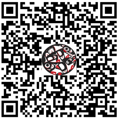
Gitanyow Tourism Website